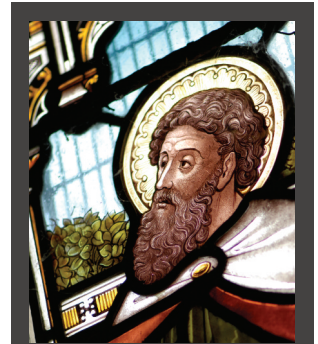
Stained glass windows, particularly those of historic interest, should be suitably protected against accidental damage.

Provisions should be made for gas cylinders, paints, oils and any other flammable liquids or materials to be stored outside, well away from the building in secure, lockable, adequately ventilated compounds. Smoking must be prohibited in storage areas. Building materials are attractive to thieves and precautions should be taken to prevent their unauthorised removal. If spraying of roof timbers is undertaken, this should only be done in a well-ventilated atmosphere and all forms of heating switched off until work is complete. Illumination of the work area should be by means of suitable low temperature fluorescent lighting. Halogen lights must not be used.